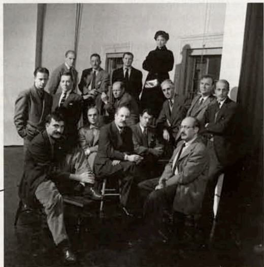
The Irascibles 1951

Everyone in the scene can feel the tide changing, and something new is brewing in the air. And said scene, no longer limited to downtown Manhattan, has expanded into something mercurial and sprawling. Even when the times are riddled with uncertainties, creative minds are restless and resourceful. To quote Hunter S. Thompson’s famous line: “When the going gets weird, the weird turn pro.” So here, as an homage to “The New Irascibles,” we present a band of young, brave hearts, from Jersey City to the Lower East Side to Bushwick, who have been forging ahead steadily, creating their own momentum, movement, style and even a couple of new business models. They are The Next Irascibles, as photographed by Timothy Greenfield-Sanders.